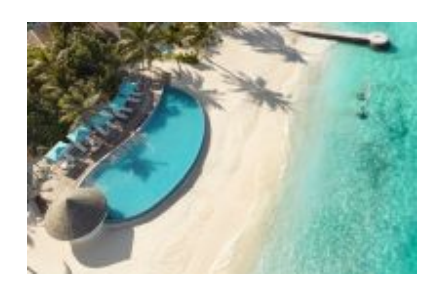
ALL INCLUSIVE AT NOVA MALDIVES