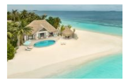
SOULFUL SUMMER ESCAPE